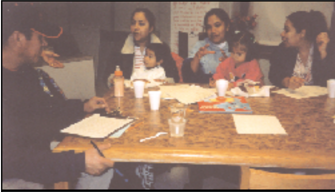
Parents work in groups at the workshops, emphasizing teamwork and relationship-building.

“This mother kind of broke down, nearly in tears, and said ‘This helps me to understand that I should never tell my child ‘you’re dumb’ or ‘you don’t know what you’re doing.’ I just feel so bad that I’ve done that, because I don’t want to feel that way here.’ That parent, a mother isolated in her home, probably thought this was natural (her behavior with her child). This is what she does all the time. But coming to the workshops she begins to realize that there’s another and better way.”