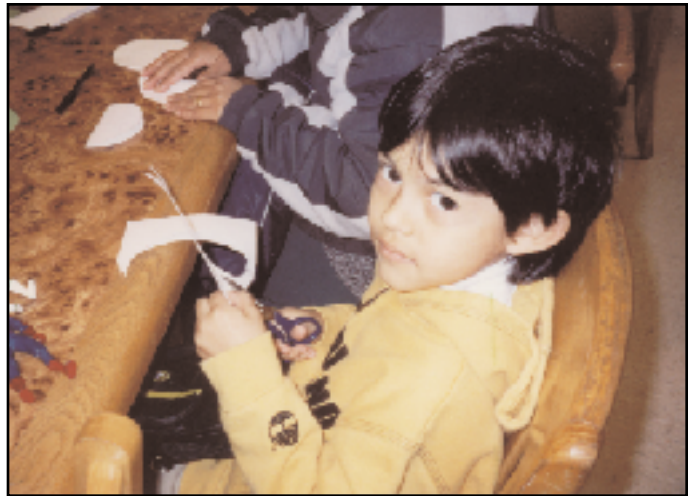
Children are welcome participants in the parent workshops.

This initiative seeks to demonstrate how to accelerate school improvement in Chicago by bringing to scale a practical, research-based model of strategic school improvement. The model involves networks of neighborhood schools which focus on the three most statistically significant drivers of Chicago’s school improvement: quality of instruction, parent engagement, and shared leadership, plus a culture of continuous improvement. (See diagram, right.)