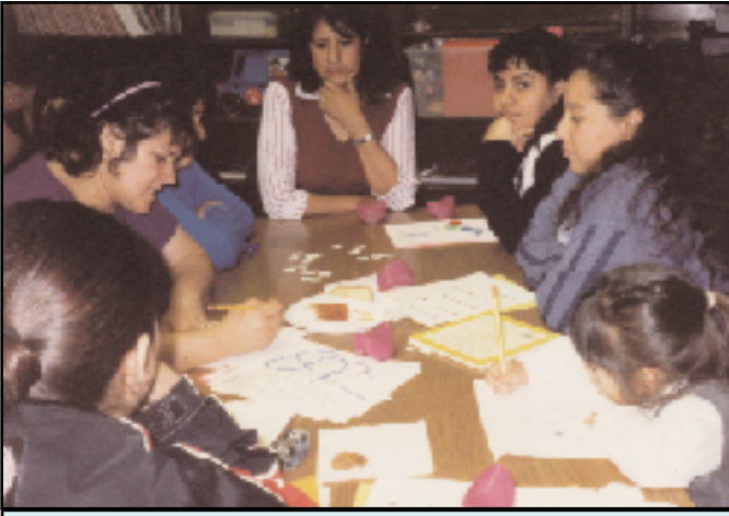
Parents participate in a workshop at Orozco Community Academy.

In the shadow of Chicago's Mexican Fine Arts Center Museum, Orozco Community Academy is a beacon for parents in the predominantly Latino neighborhood of Pilsen. Orozco educates roughly 760 middle school students, more than 95 percent of whom are Latino and from low-income families. Nearly a quarter of Orozco students are learning English as their second language.